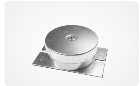
TYPE ESL og ESL-HD